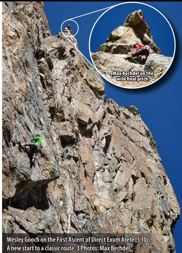
Wesley Gooch on the First Ascent of Direct Exum Arete (5.10c). A new start to a classic route. 3

Direct Exum Arete (5.10c), a new start to a classic route.