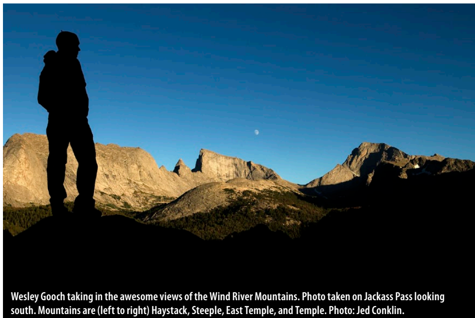
Wesley Gooch taking in the awesome views of the Wind River Mountains. Photo taken on Jackass Pass looking south. Mountains are (left to right) Haystack, Steeple, East Temple, and Temple.