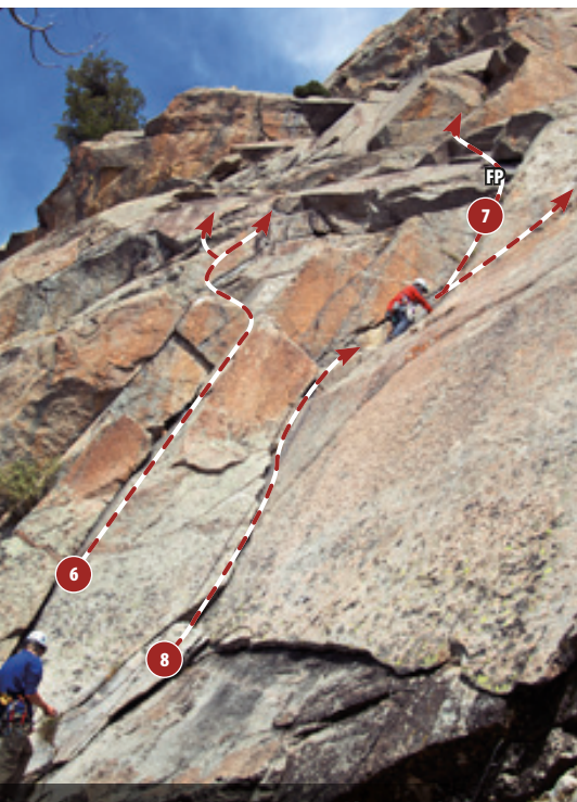
Josh Hattan on The Black Book - 5.8.

Although the crux of this route can be protected with a .75 camalot, the preceding small 5.7 runout section tends to deter some climbers. Start in the same corner as Photo Finish and Centerfold . Follow the right-