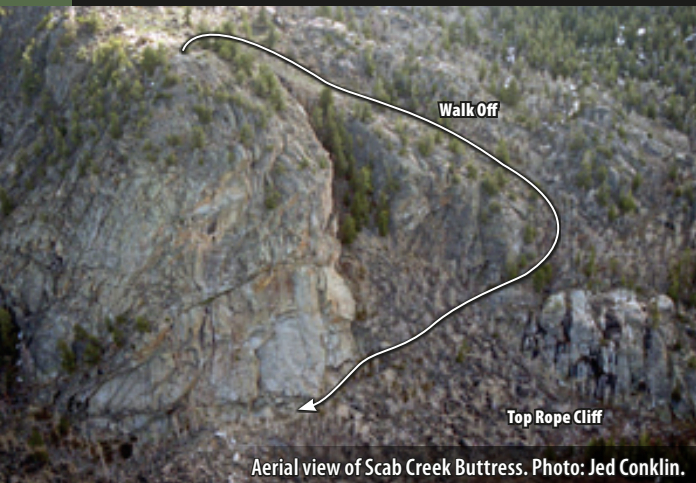
Aerial view of Scab Creek Buttress.

don't park at the main parking lot. Instead, continue down the road to the campground. Park just before the campground in a small grassy area and walk up a short two-track road north of the campground. The two-track road is the last left before the campground. The trail begins where the two-track ends.