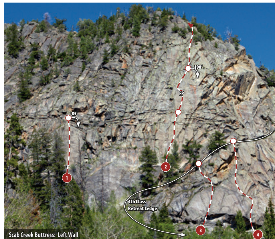
Scab Creek Buttress: Left Wall