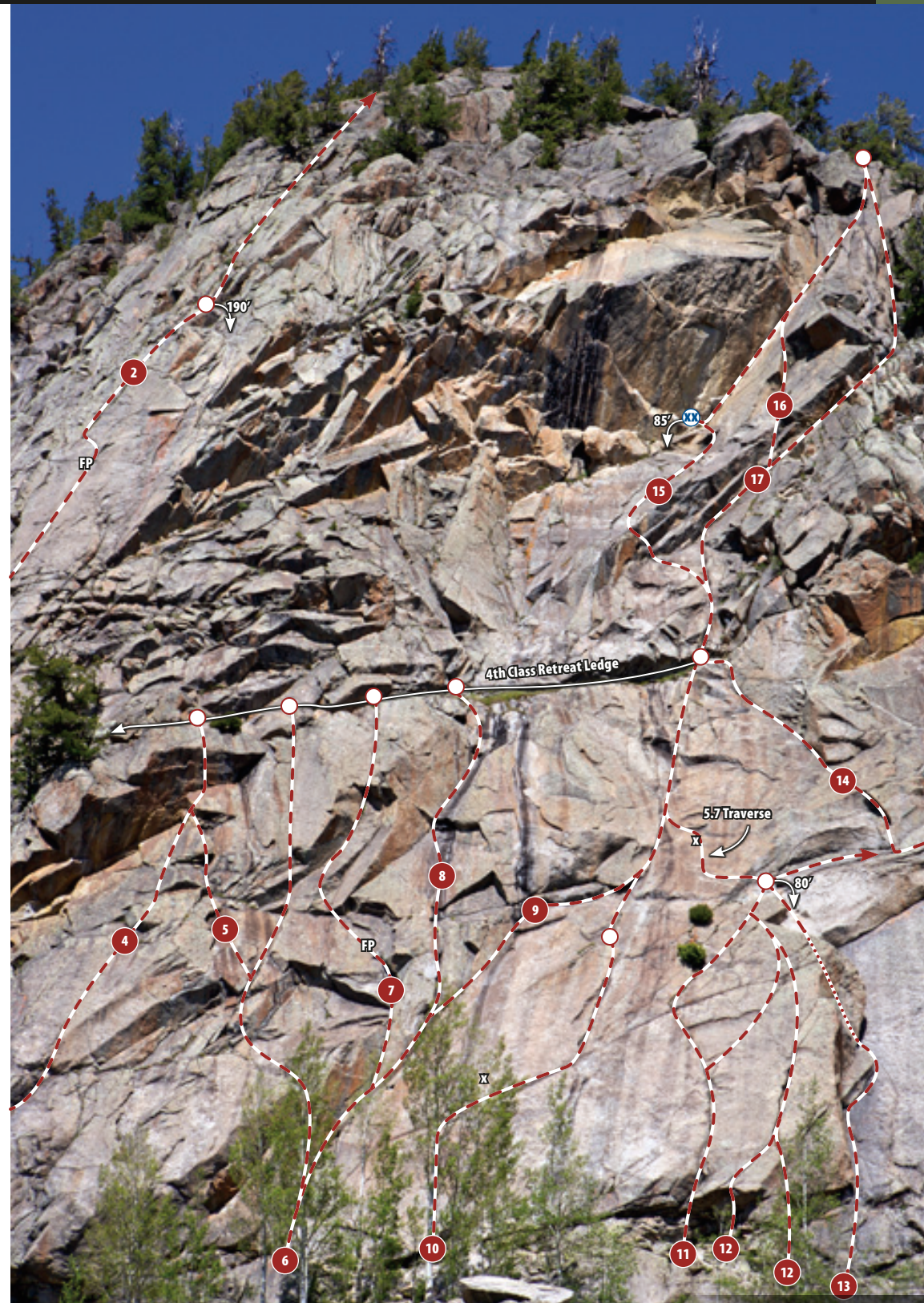
Scab Creek Buttress: Middle Wall

Scramble fifteen feet to the start of a right-facing corner that eventually becomes a flaring notch. Follow the notch to the Grassy Crack belay ledge.