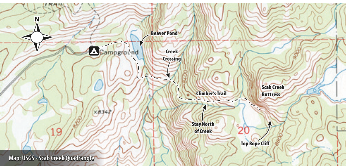
Map: USGS - Scab Creek Quadrangle

Originally, this area was developed by the National Outdoor Leadership School (NOLS). However, at the time of this writing, the approach trail has not been maintained for years. As a result, the trail has progressively become worse and is quite vague in places. Losing the trail can be easy. In these sections, follow the line of least resistance until the trail becomes clear again. Use the topographic map below for additional guidance.