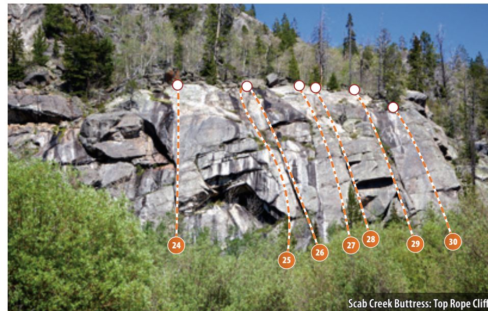
Scab Creek Buttress: Top Rope Cliff