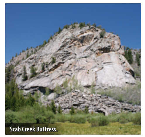
Scab Creek Buttress.

Twenty-four miles southeast of Pinedale, Wyoming, tucked just inside of the Wilderness Boundary lies a 400-foot buttress of bombproof Wind River granite. Scab Creek Buttress offers climbers a day trip wilderness experience and on most summer days, you will have the entire buttress to yourself.