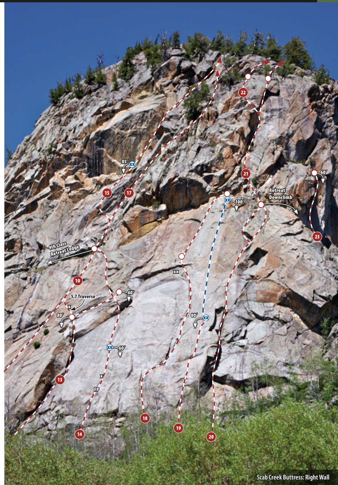
Scab Creek Buttress: Right Wall